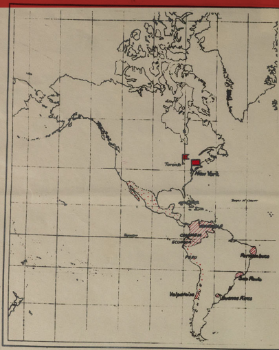
Image citation: HS 8/244: Progress reports to Chiefs of Staff (series R). With 2 maps. 1942.

From the international machinery of espionage and twentieth century warfare, to personal surveillance and Cold War intelligence, this uniquely broad view of the interests of the British government, her allies and her enemies is sourced from five government departments and totals around 500 000 pages.