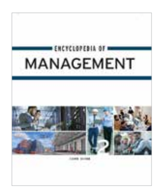
Encyclopedia of Management, 8^{\text{th}}\,\text{Ed.}

Offer unlimited, simultaneous access to eBooks that can help put new entrepreneurs and small business owners on a path to success.