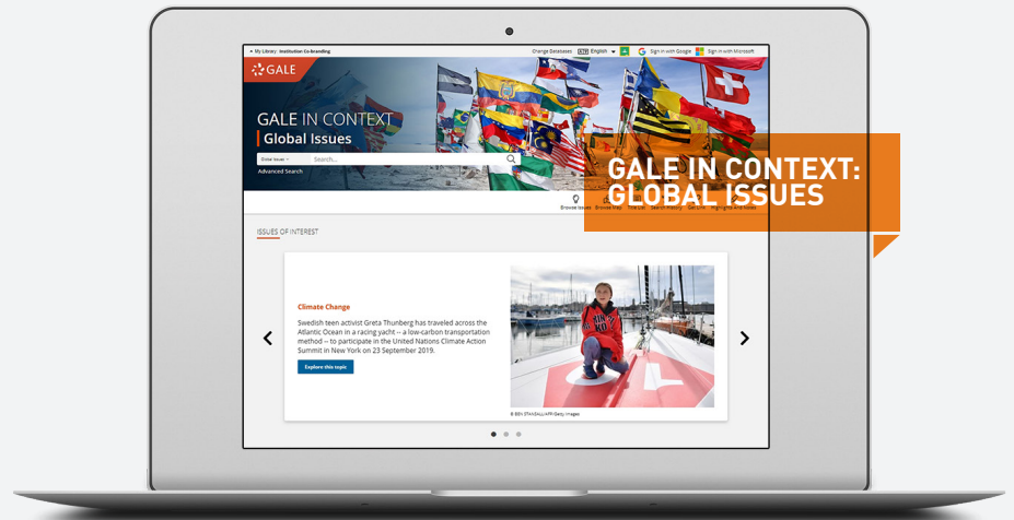
Product screen capture as of August 2019. Actual interface may vary.