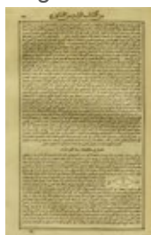
Avicenna, القانون في الطب [al-Qānūn fī al-ṭibb]. Typographia Medicea, 1593. Early Arabic Printed Books-BL: Science and History, https://link.dev.ggtest.com/apps/doc/DOLLJJ371591470/EAPB?u=omni&sid=bookmark-EAPB&xid=c534cd2b&pg=1&xty=open . Accessed 8 Feb. 2023.

Regarded as one of the most brilliant polymaths of his age, Ibn Sīnā's many writings on philosophy, physics, and astronomy still survive today, including two of his most influential works, The Book of Healing (Kitāb al-Shifā) and The Canon of Medicine (al-Qānūn fī al-ṭibb) . There are three Arabic language editions of the latter text as well as the translation into Latin by Gerard of Cremona, and Averroes's commentary on the work.