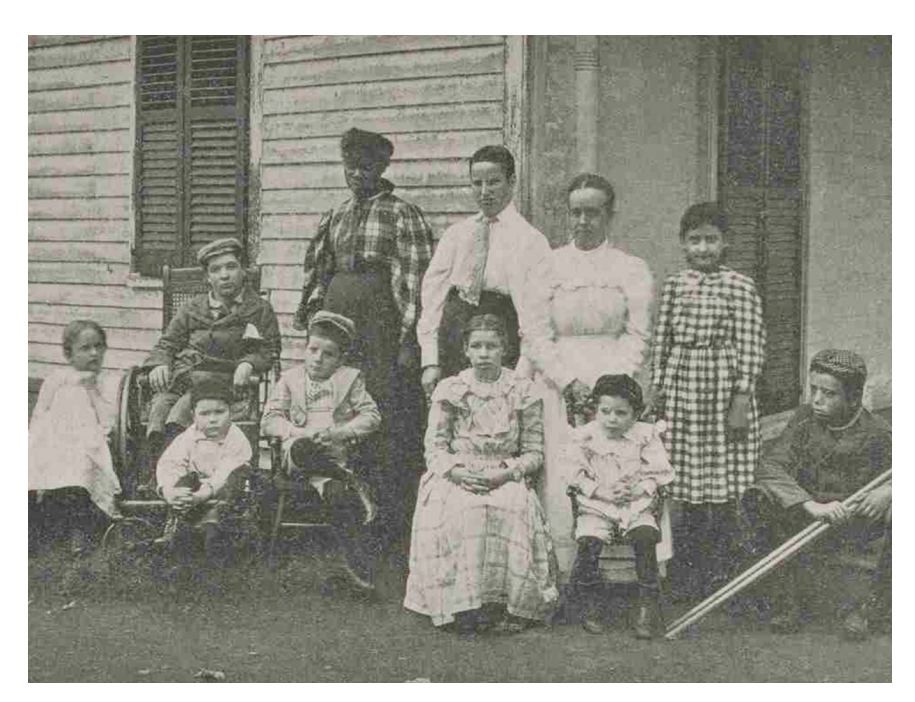
Children at the Newington Home for Incurables, Newington, Connecticut, circa 1899.