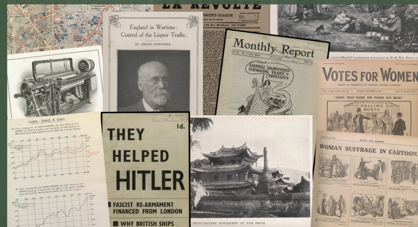
Images are from various sources within The Making of the Modern World: Part III